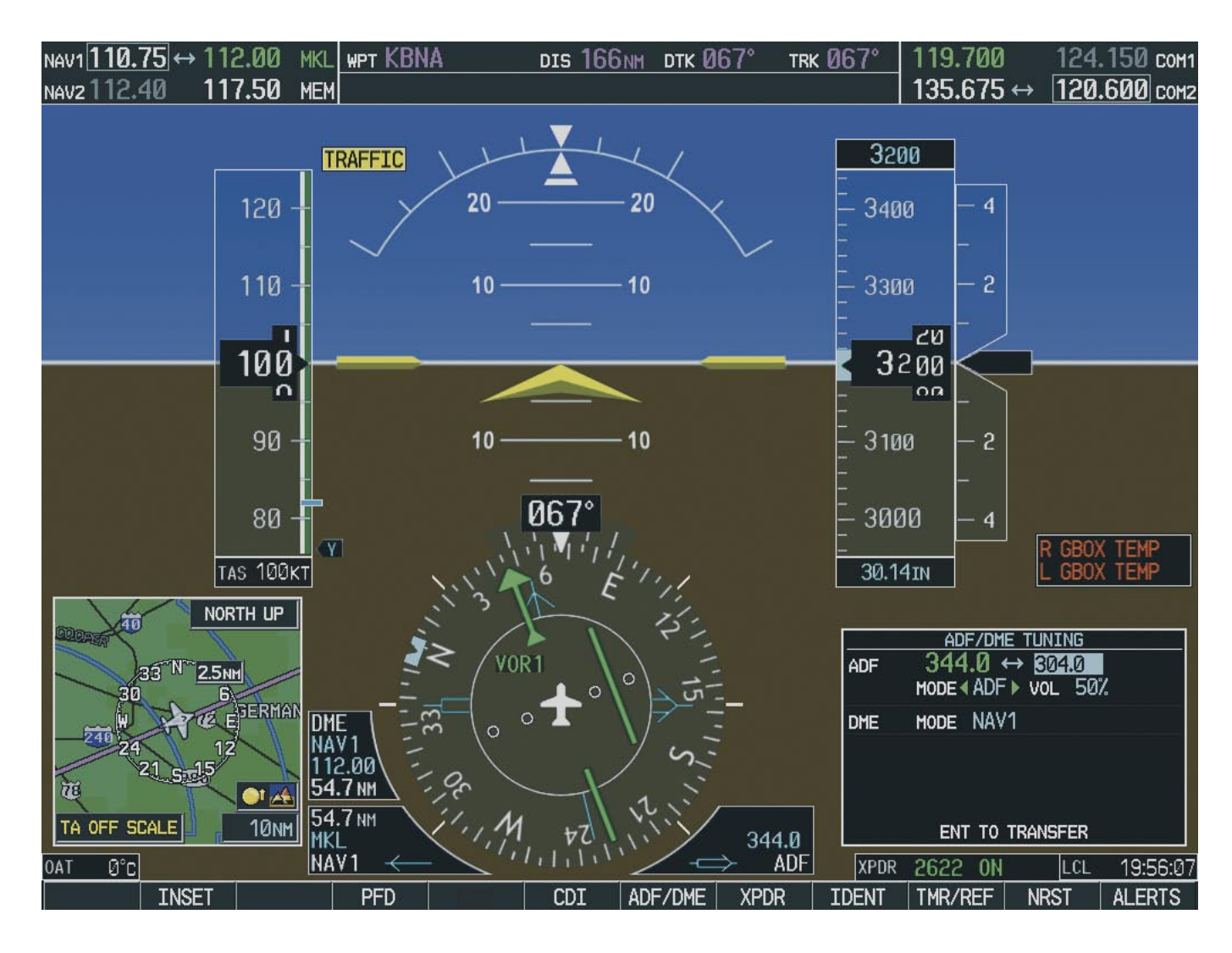
Figure 2 GDU 1040 (PFD Shown)

Both GDU 1040 displays are identical in hardware. The aircraft wiring harness determines whether the display functions as a PFD or an MFD (see Figure 2). A configuration module within the PFD connector contains aircraft-specific backup configuration data.