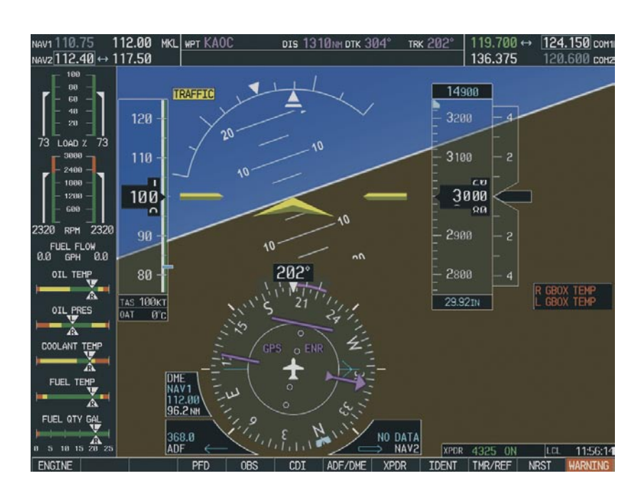
Figure 3 Reversionary Mode